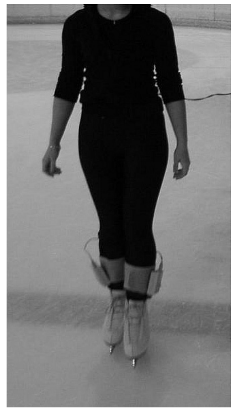
Fig. 1. A participant wearing the F-scan in shoe pressure system with cuffs attached about the lower shanks

Metatarsal Head (4&5MTH), 6 = Medial Arch (MA), 7 = Lateral arch (LA), 8 = Medial Calcaneus (MC) and 9 = Lateral Calcaneus (LC). Pressure and force data were reported for each area (Fig. 2).