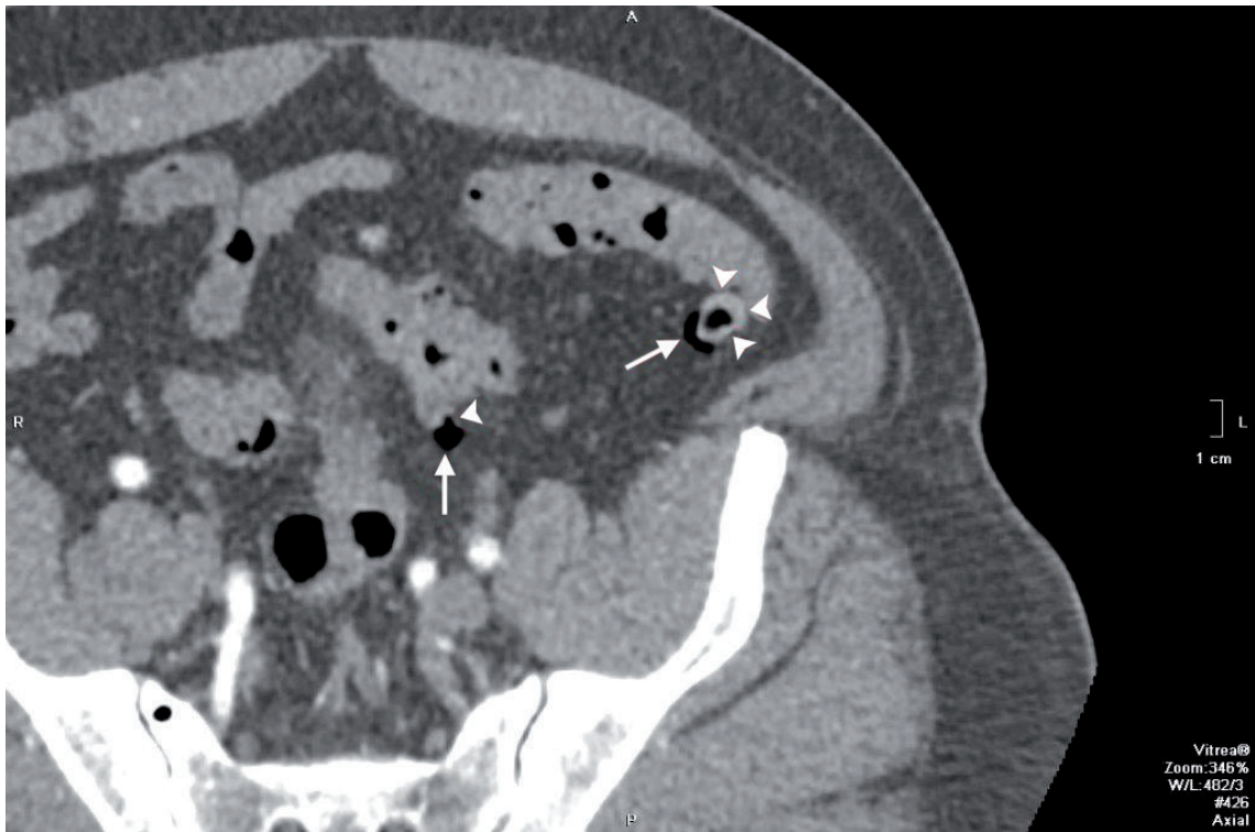
Fig. 3. The third type of diverticula - represents a combination of the first two types (marked by the red arrows).

pilots of highly maneuverable aircraft. Computer-based annual follow-up examination of the abdomen would provide insight into the possible advancement of diverticular morphological changes. Changes in the morphology of thick wall (true?) and “intermediate” diverticula into very thin-wall diverticula (typically pseudodiverticula), are associated with unfavorable and rapid progression of the disease, likely under the influence of extreme flight conditions. Such changes would signify an increased risk of potential perforation of the colon due to increased pressure in the abdominal cavity during flight. Both, acceptance or rejection of the hypothesis is difficult to prove. This would require follow-up computer testing of individuals with diverticulosis over a period of many years, which is impossible to carry out on a large group of pilots.