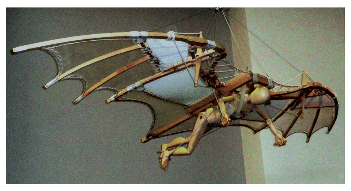
Fig. 1. Model of Leonardo Da Vinci's ornithopter (Source:http://www.katalogmonet.pl/Katalog/Pieni%C4%85dz-zast%C4%99pczy/III-RP-%C5%BBetony/%C5%BBetonypami%C4%85tkowe/19873-20-ornitopter%C3%B3w-Leonardo-da-Vinci-WZORZEC-PRODUKCYJNY-DLA-MONETY-PR%C3%93BA-mied%C5%BA-patynowana-dp2).

It was the military aviation during the Second World War that began to pay attention to the ergonomics of aircraft, as well as the appropriate procedures for training pilots. At present, both military and civil aviation have a wide database of aviation events (incidents, accidents and catastro-