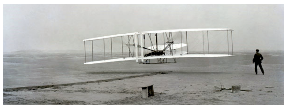
Fig. 3. The Wright Brothers' machine

the percentage share of accidents in the number of air operations is very similar and is still decreasing. In addition, it is worth mentioning that there are far more accidents in private air traffic than in commercial air transport, where pilots are much better trained and airlines make every ef-