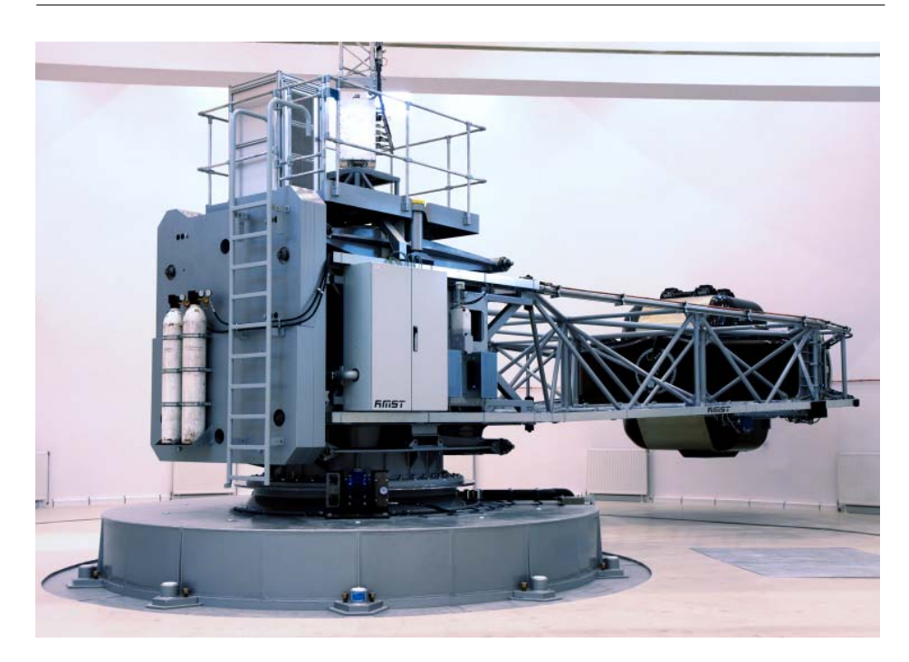
Fig. 1. New human centrifuge at Military Institute of Aviation Medicine in Warsaw, Poland. Ryc. 1. Nowa wirówka przeciążeniowa w Wojskowym Instytucie Medycyny Lotniczej w Warszawie.

The Polish Journal of Aviation Medicine and Psychology, 2012, 3(18), 71-80