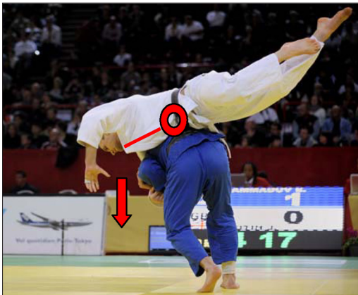
Figure 2. Seoi-nage is typical technique of Physical lever applied with variable arm [8].

more energy-consuming, as already demonstrated in many specific papers [10,14–17].