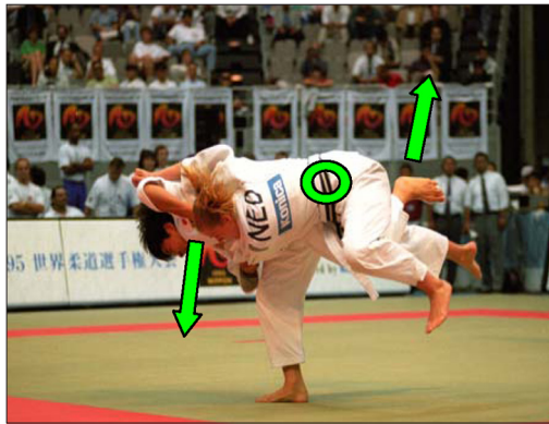
Figure 3. Uchi-mata is typical technique of Couple forces applied by trunk and leg [8].

of makikomi supplementary movement in PLvA application, however the weaker arm strength and, in general, different hip and gluteus dimensions make it very difficult to use these techniques fast and explosively.