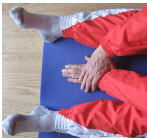
Figures 15. Continuation of the detailed measurement (in this example the raw score '0.5-' indicates the relatively high level of flexibility) [5]