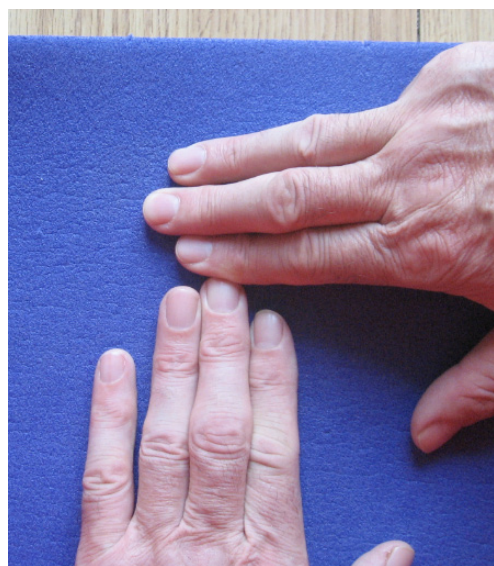
Figures 13. Example of measured flexibility (results below the determined line) [5]

Task 4 – non-apparatus flexibility test (the manual of test in [5]); raw result is actually an equivalent, whereas “general level of flexibility” based on “raw results” is corrected to “SFP profile”. For the measurement method see Figures 13-15.