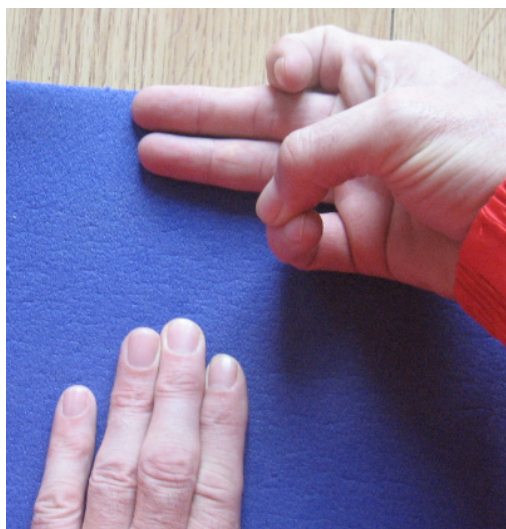
Figures 14. Initiation of detailed measurement (from dactylion III to determined line) [5]