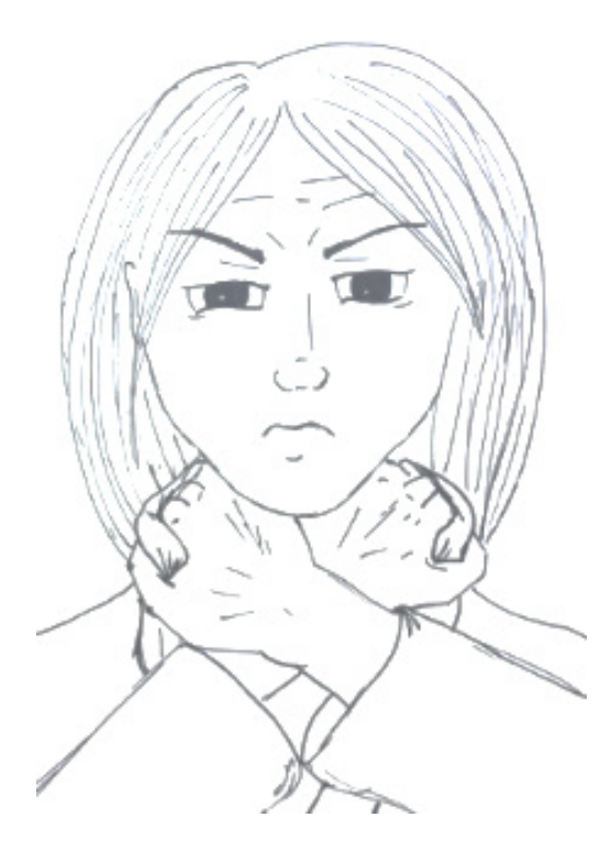
Figure 2 . The way of performing the kata-juji-jime (single cross hold).

Usage of QASWT algorithm: judo expert (experienced judo instructor) explains physiological basis of a chokehold by pressure on carotid artery (with hands or by use of collar of judogi) and simplest katsu technique in a case of fainting (rising legs of the person, who is lying on the back). Then he demonstrates and explains rules of application of kata-juji-jime (single cross hold) in vertical posture during QASWT (Figure 2). After that, he explains criteria of evaluation, demonstrates and explains a way of stopping chokehold during QASWT (give up: maitta) by tapping out and clarifies a role of assistant.