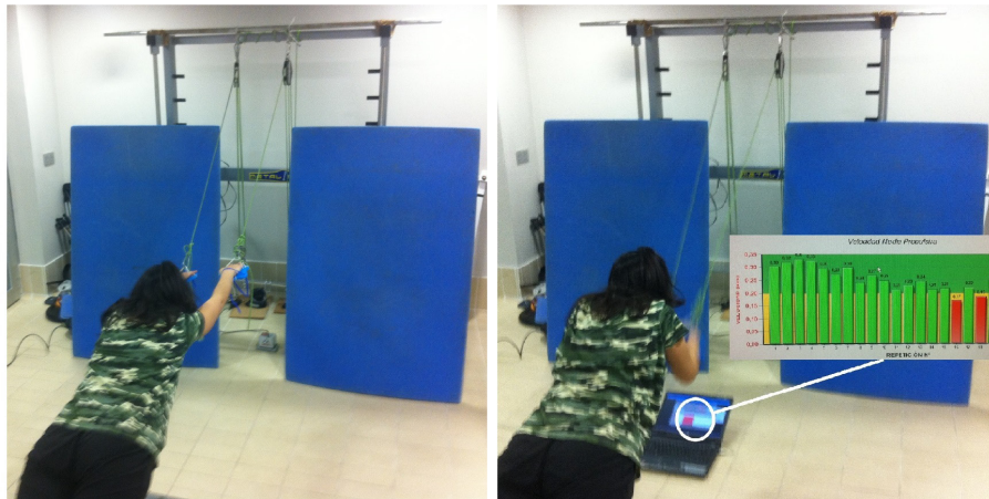
Fig. 1. The Smith Machine device showing both conditions (left: verbal feedback, right: visual feedback)