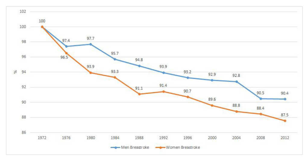
\textbf{Fig. 1.} \ \, \textbf{Dynamics of the variability of sports results in breaststroke during the Olympic Games in 1972–2012 due to the indices with variable bases