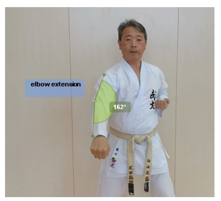
Figure 2. Example of elbow extension assessment using Kinovea [2].

is necessary to build trust among the competitors and eliminate doubts of others potential cheating. That is the essence of this checking system: it is not strictly to discover cheating. This kind of analysis is not as accurate as a biomechanical assessment. Judges should therefore not rigidly stick to a measurement obtained from only one perspective, but rather analyse different approaches to movements in order to get a broader perspective of competitor performance.