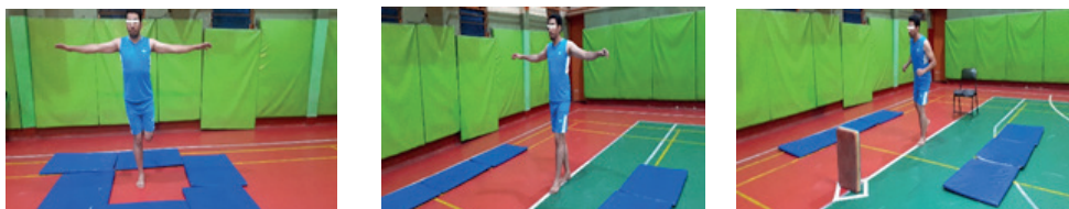
Fig. 2. a) Modified stork stand balance test, b) Tandem walking test, c) TUG test

TUG: This test was designed by Matthias in 1986 and had a scoring scale of 1-5. The timed get up & go (TUG) test consists of sitting on a chair, standing, and walking up to 3 meters, coming back, and sitting on a chair again (Fig. 2c). The criterion for this test is the length of time that a person performs the motion manoeuvre from the moment of getting up from a chair to sitting down again, measured using a chronometer. The length of this test for young people is 5-7 seconds [24]. The validity and reliability of this test were reported to be very high [25].