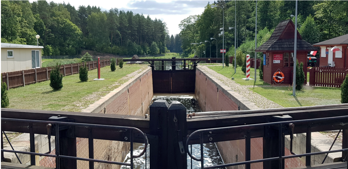
Fig. 1. Kurzyniec Lock as a border crossing. The border between Poland and Belarus runs along the axis of the Lock, and further along the Canal for some 3.5 km

mostly in a position to cultivate their own traditions [30]. The Augustów Canal is regarded as a historic monument [34]. The land along it has highly valuable natural features, given the resources of both water and forest, as well as the inclusion of two transboundary areas, i.e. the Bug Euroregion and the transboundary functional sub-region of the Augustów Forest and Augustów-Grodno [12, 16, 35].