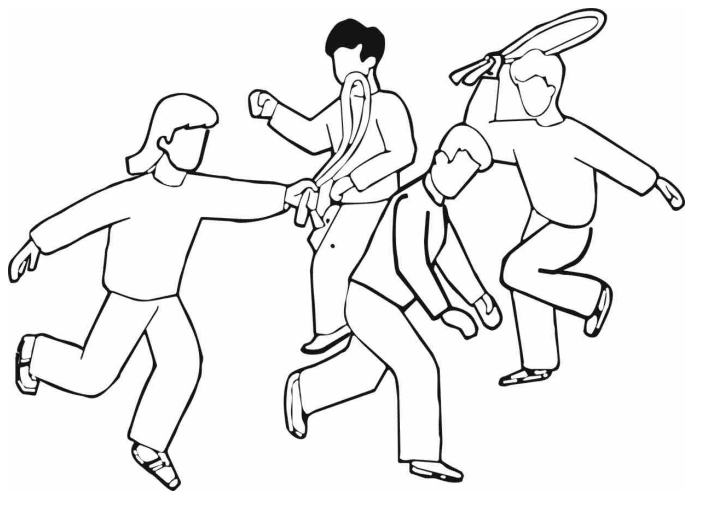
Figure 2. "Mischievous fox" example, fun forms of martial arts of the category "8 - comprehensive settling of close combat" [31].

Consequently, we are convinced that already in the initial phase of education each individual should learn elements of self-defence in a wide sense – to protect one's body during falls and collisions with other objects (wall, thrown stone etc.), as well as in situations of danger of physical aggression, respecting principles of necessary defence. On the basis of those presumptions and assumptions we associate the main objectives of propaedeutics of combat sports with elements of judo (especially the ability of falling safely) and formulate them in the following way: