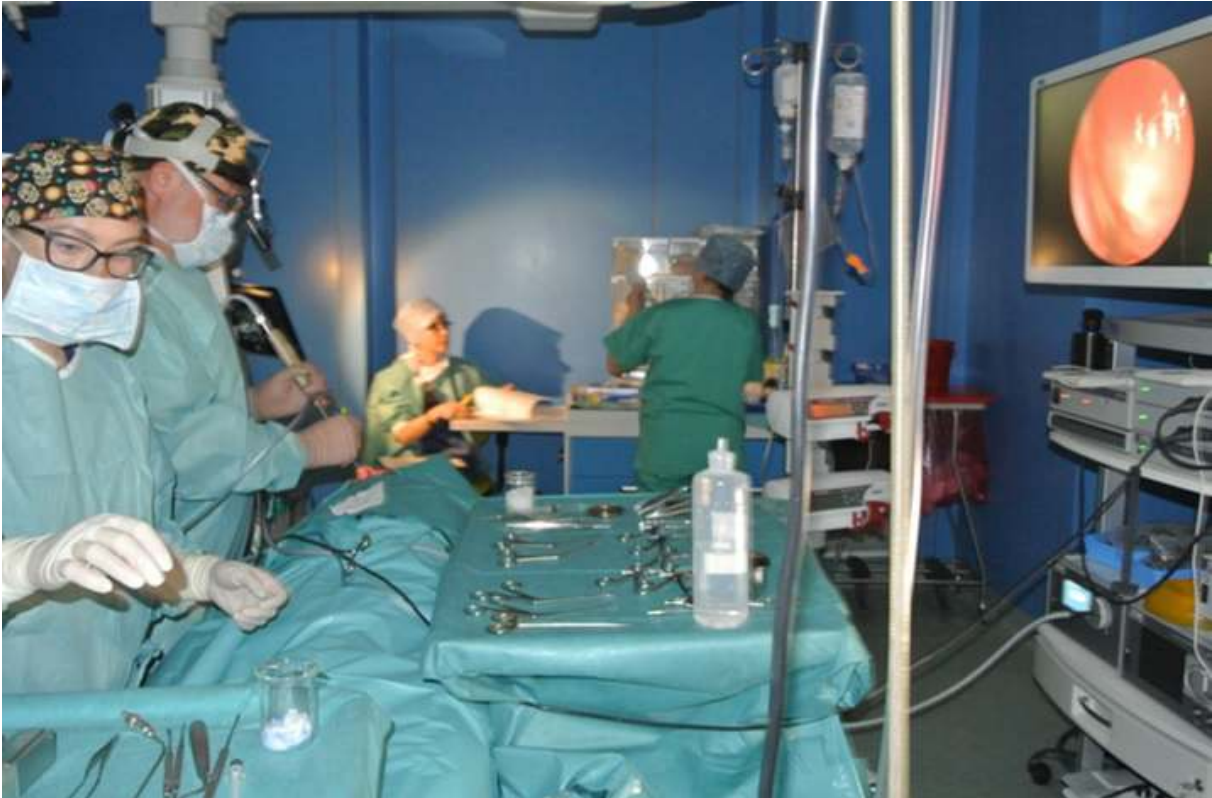
Fig. 3. Endoscopic surgery performed using 3D technology.