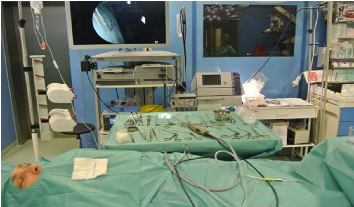
Fig. 2. Endoscopic set with 3D video track.