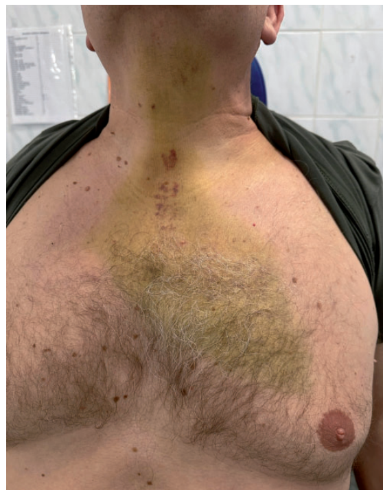
Fig. 3. Hematoma on the anterior surface of the thorax 3 days after the admission.

Three days after the admission, an ecchymosis was observed on the anterior surface of the thorax (Fig. 3). A follow-up contrast-enhanced CT scan of the neck was performed, demonstrating thickening of the soft tissues with accompanying fluid bands within the retropharyngeal space at the level of the oropharynx and hypopharynx, both